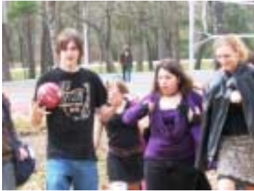
VPA students have fun in the park after their excursion to Swing.

After traveling downtown Houston to see an eye-popping display of dance at the Hobby Center, VPA students took brown-bag lunches to Frankie Carter Park for a picnic.