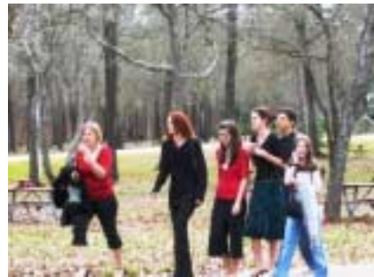
VPA students take a walk in the park after their viewing of Swing.

Students ate their lunches under the trees and in the fresh air. Which, by the way, was a welcomed change from the long trip from downtown in the bus. Students walked around the perimeter of the park, talking and laughing. Others played volleyball or sat in groups on the picnic tables. It was a relaxing ending to a day of fun in VPA.